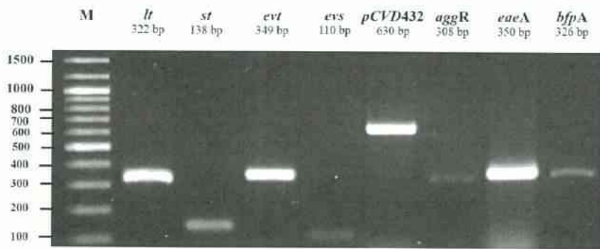
Figure 2 Agarose gel electrophoresis of 1% agarose of the amplification products of virulence genes and plasmid for ETEC ( It , st ), EHEC ( evt , evs ), EAEC ( pCVD432 , aggR ), and EPEC ( eaeA , bfpA ). M, DNA Marker.